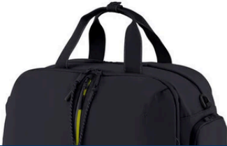
KIT Bag Sponsorship