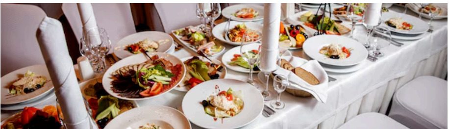
Gala Dinner Sponsorship