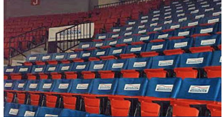
Chair Cover Branding (Hall A & Hall B)