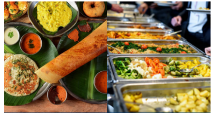
Day 2 - Breakfast & Lunch Sponsorship